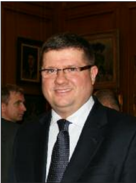
Sławomir Skrzypek, President of the National Bank of Poland

The assembled guests included bankers from Wall Street's top firms, and Mr. Skrzypek told them that Poland's economy still stands out in Eastern Europe. Despite the worldwide financial slowdown, Mr. Skrzypek said his nation's economy is doing relatively well. Poland's economy grew by 2.9 percent in the last quarter of 2008. While that was still ahead of many European countries, it was down from the fourth quarter of 2007 when the Polish economy grew by 6.5 percent.